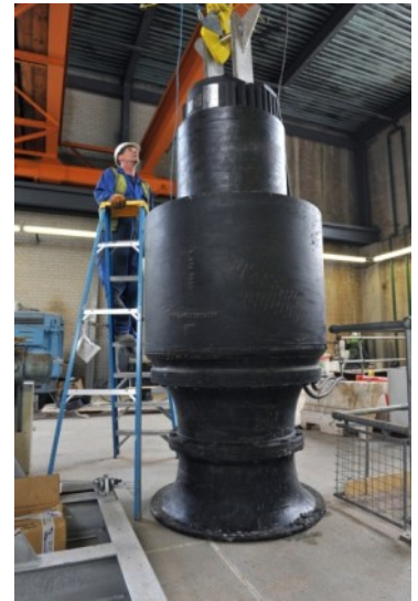
Bedford Pumps' Storm Pump for Ashton Avenue

Bedford Pumps also supplied Pump Condition Monitors and Canisters for the Storm Pumps. Air release valves are included on the top of each canister and Bedford Pumps innovative "Latch Lift" system ensures speed, efficiency and cost savings when accessing the pumps.