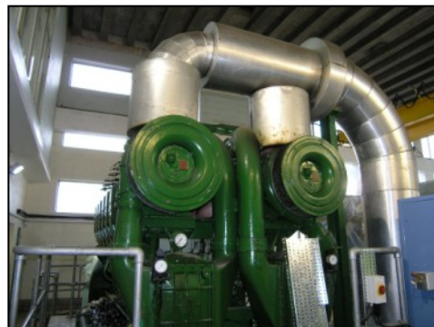
Original diesel engine driving the pumps

Bedford Pumps proposal, which was subsequently accepted, was for canister units instead of conventional lineshaft units, which reduced the capital cost, improved health and safety conditions, increased efficiency and gave more available floor space. Bedford Pumps designed and manufactured a revolutionary variant to a standard submersible. These pumps are bespoke and unique, driven by 620 kW 3.3kV motors and incorporating an integral IP68 planetary gearbox within the unit, thus enabling the motors to be a 6-pole rather than a much larger 26-pole motor that would have been required for a direct drive pumpset.