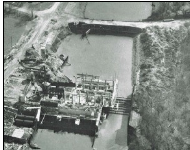
Altmouth Pumping Station constructed in 1972

The pumping station used both Storm and Dry Weather Flow pumps which had come to the end of their design life and were becoming increasingly expensive to maintain. The Environment Agency put its MEICA (Mechanical, Electrical, Instrumentation, Control and Automation) team forward to work with the key suppliers in finalising the design for Altmouth.