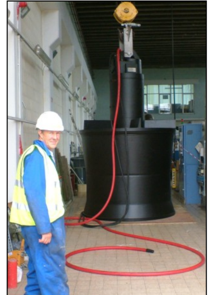
Bedford Pumps' Storm Pump for Altmouth P.S.

The low-lying surrounding area of Formby, just South of Southport, has a history of flooding since the land was reclaimed from the sea by local monks in the 13 th century. Following extensive flooding in the mid 1950's the Altmouth Pumping Station was constructed in 1972 to drain the land for agricultural purposes and at that time was the largest station of its type in Europe. Due to its age and the condition of the pumping equipment the decision was made to invest £10.7M refurbishing the site.