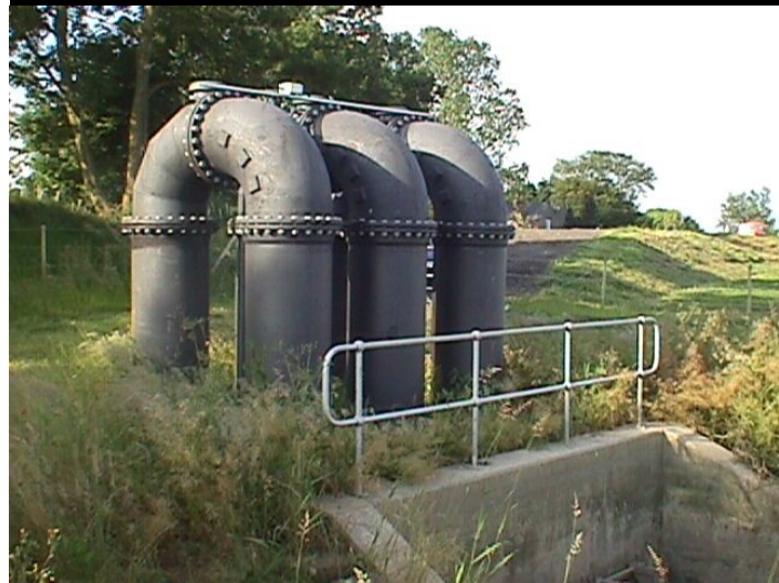
Siphon Breaker Valves from Bedford Pumps

A Siphon Breaker Valve is effectively a small paddle operated butterfly valve fitted with an extended spindle. The valve is normally open so that when the pump starts air in the pipeline is emitted through the valve until the rising water column acts against the paddle attached to the end of the spindle and closes the valve. Once closed, the pipeline becomes primed and a siphon is established. Forward direction of flow maintains the pressure on the paddle keeping the valve closed and maintaining the siphon. The siphon is broken when the pump stops; the reverse flow acts on the paddle and opens the valve, thereby destroying the vacuum in the pipe and preventing continuous reverse flow through the pump.