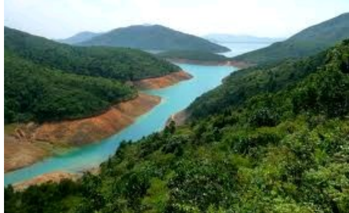
Reservoir in Hong Kong

Benefits of the system are recouped whenever the plant is running. In the case of this application the plant is running continuously, resulting in substantial cost savings.