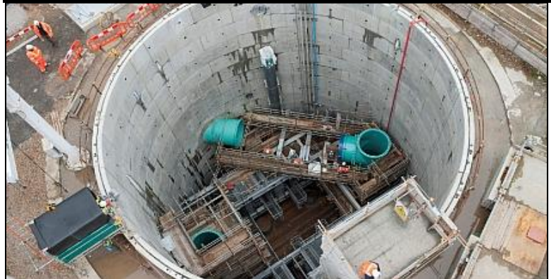
Coppermills WTW installation process